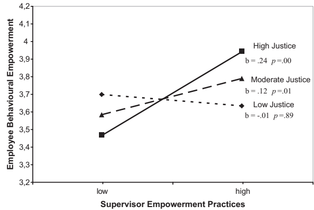
Figure 2. Relationship between supervisor empowerment practises and employee behavioural empowerment for low, moderate, and high levels of justice.

in the analysis of results. Another way for minimising the common method bias could have been to solicit an external source to assess employees' behavioural empowerment. However, there is some evidence that common method variance was not a major threat that could invalidate the present results. First, results of CFAs showed that SEMP could be successfully differentiated to each moderator (climate and justice) in our measurement model, suggesting that the use of common methods might not have exerted a very strong force in explaining the relationships between the variables in this study. Second, the correlation between SEMP and behavioural empowerment found in this study ( r = .16 ) is more similar in magnitude to the average participation-performance correlation found in multisource studies ( r = .11 ) than in single-source or percept-percept studies ( r = .44 ) (Wagner, 1994).